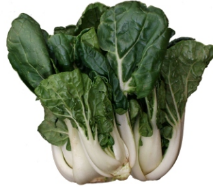
Baby Buk Choy