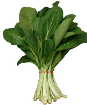
Baby Choy Sum