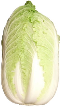
Wombok (Chinese Cabbage)