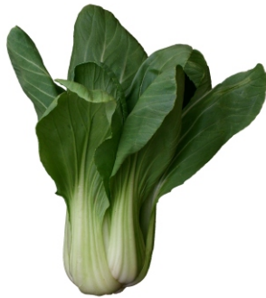
Pak Choy or Baby Pak Choy