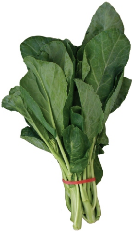
Gai Lan (Chinese Broccoli)